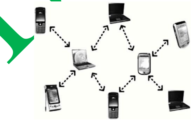
Fig. 1 An Example of Mobile Ad hoc Network (MANET)

A Mobile Ad Hoc Network (MANET) is built on the fly where a number of mobile nodes work in cooperation without the engagement of any centralized access point or any fixed infrastructure. MANETs are self-organizing, self-configuring, and dynamic topology networks, which form a particular class of multi-hop networks. Minimal configuration, absence of infrastructure, and quick deployment make them convenient for combat, medical, and other emergency situations. A sample model of mobile ad hoc network is presented here in Fig. 1,