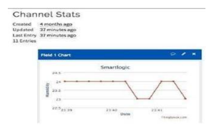
Figure (4): Temperature Graph

In result, we investigate aftereffect of the entire framework through which we examine the temperature consequence of kitchen through our plan application its checking is finished.