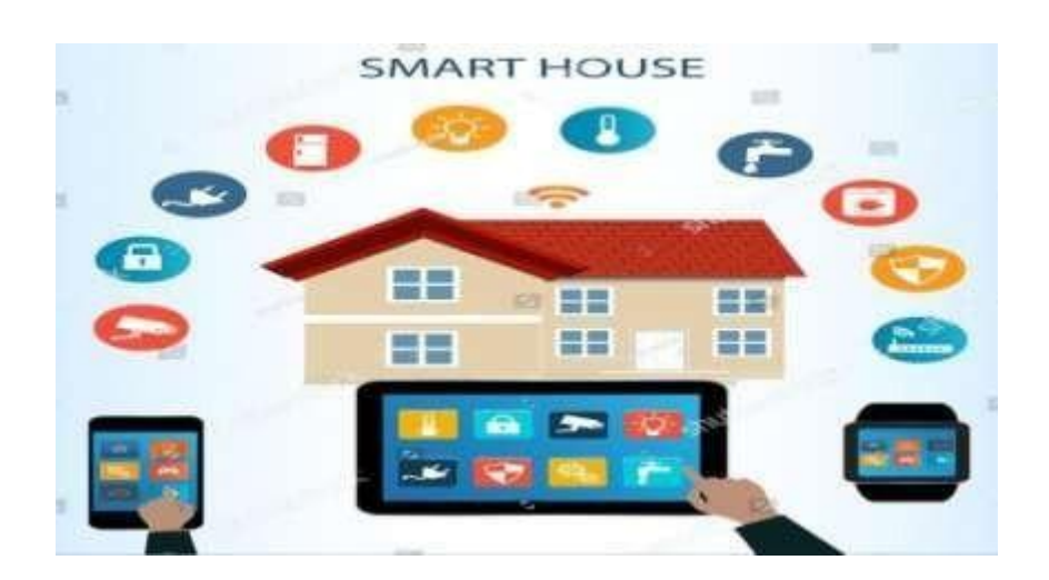
Figure (1): Smart Home Category

In prior days, electrical, electronic and electromechanical devices were supporting all regular day to day existence works out. A few gadgets were completely robotized and some were semi-computerized. Because of the progression of PC and correspondence innovation, the pattern is more towards the computerization of a large portion of the exercises which are required in an everyday movement with less human intercession. In this endeavor, we are proposing an automated gadget which tackles the possibility of the Internet of Things which is basically electronic and correspondence development which controls the home mechanical assemblies, for instance, light, fan, wrap et cetera. The proposed structure will use Arduino as microcontroller through which the contraptions are controlled. The security these days considered as noteworthy subject particularly in configuration savvy home. The essential explanation behind design wise passage jolt, using Smart Door Authentication Algorithm is to differentiate the enlisted mystery express security and each entered mystery state which may contain some wrong or swapped characters. The outcomes indicate more quality verification for access progressively.